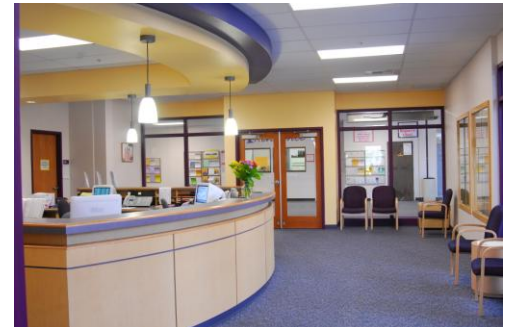
Orchard Middle School; Wenatchee, WA