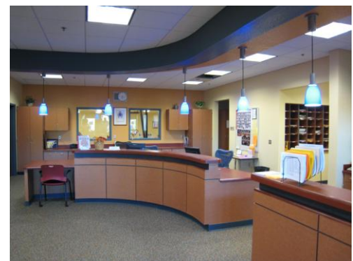
Omak High School; Omak, WA