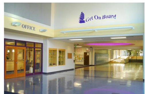
Wenatchee High School; Wenatchee, WA