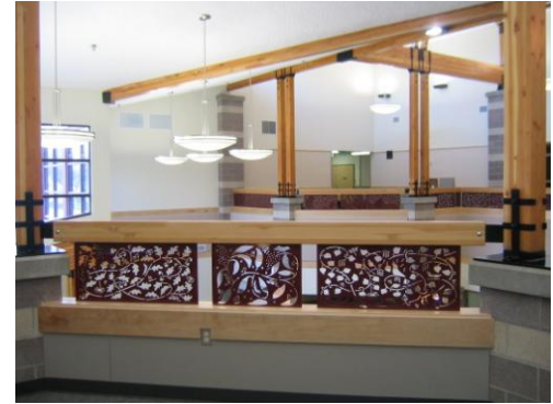
Hazel Valley Elementary School; Burien, WA